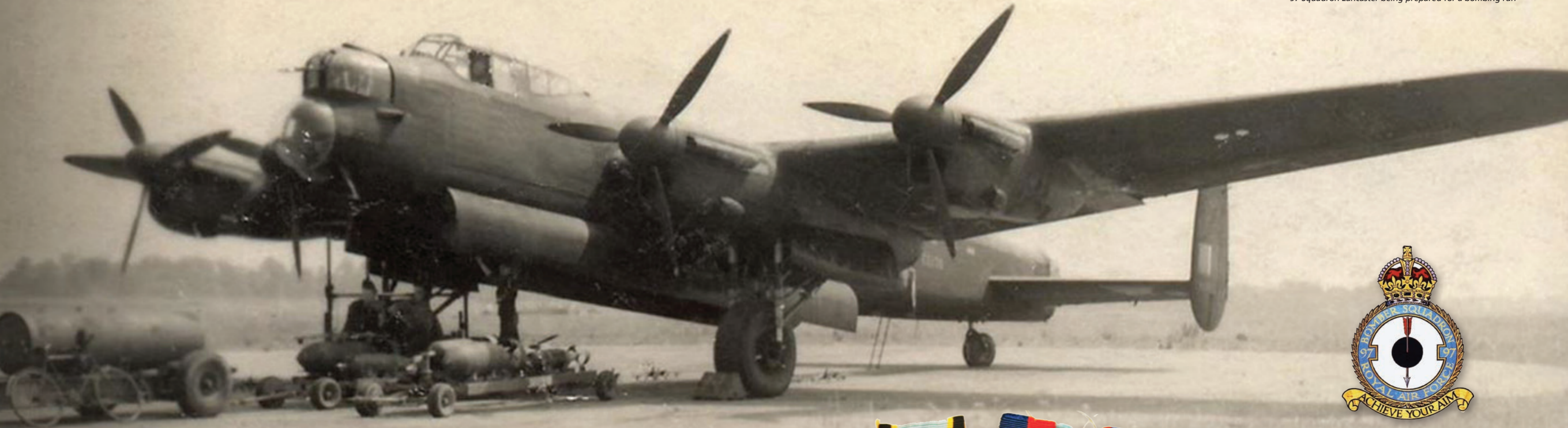
97 Squadron Lancaster being prepared for a bombing run